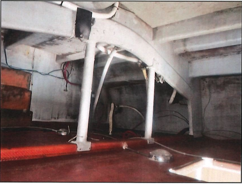
Storage space, waste system