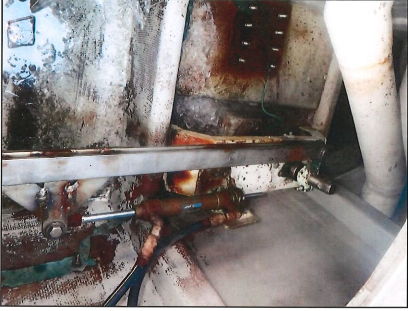
Lazarette, steering gear