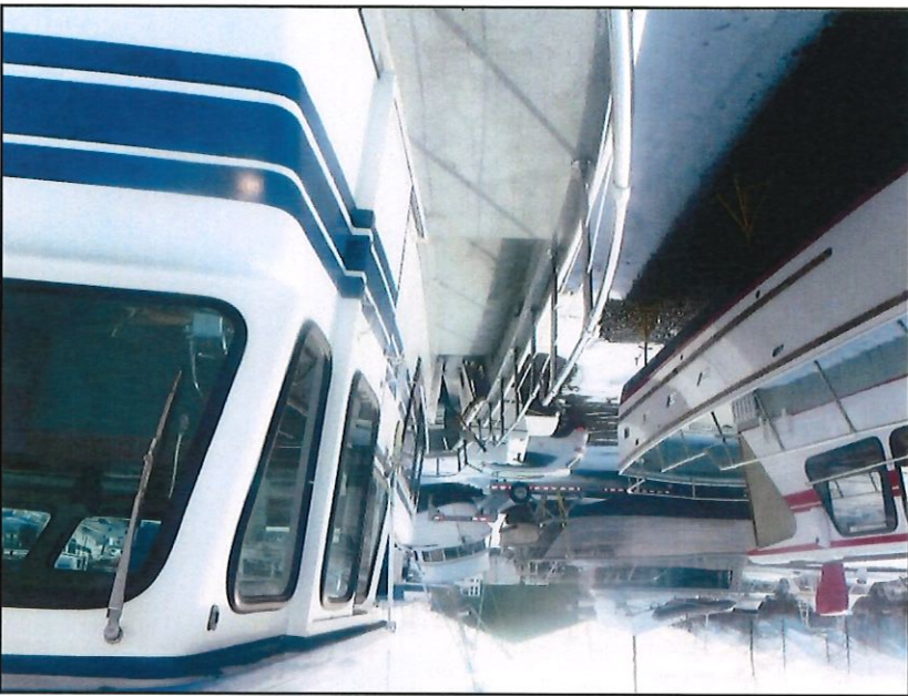
Starboard side deck