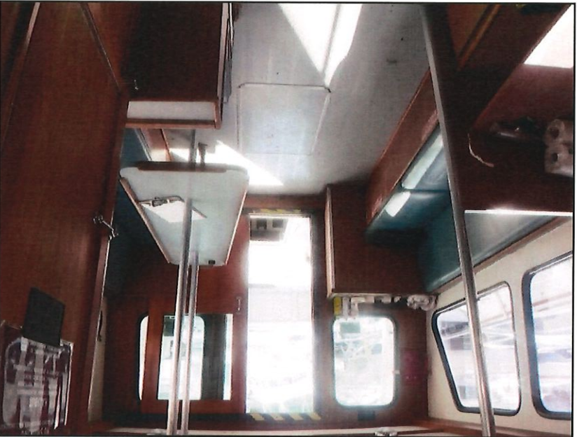
Cabin from forward